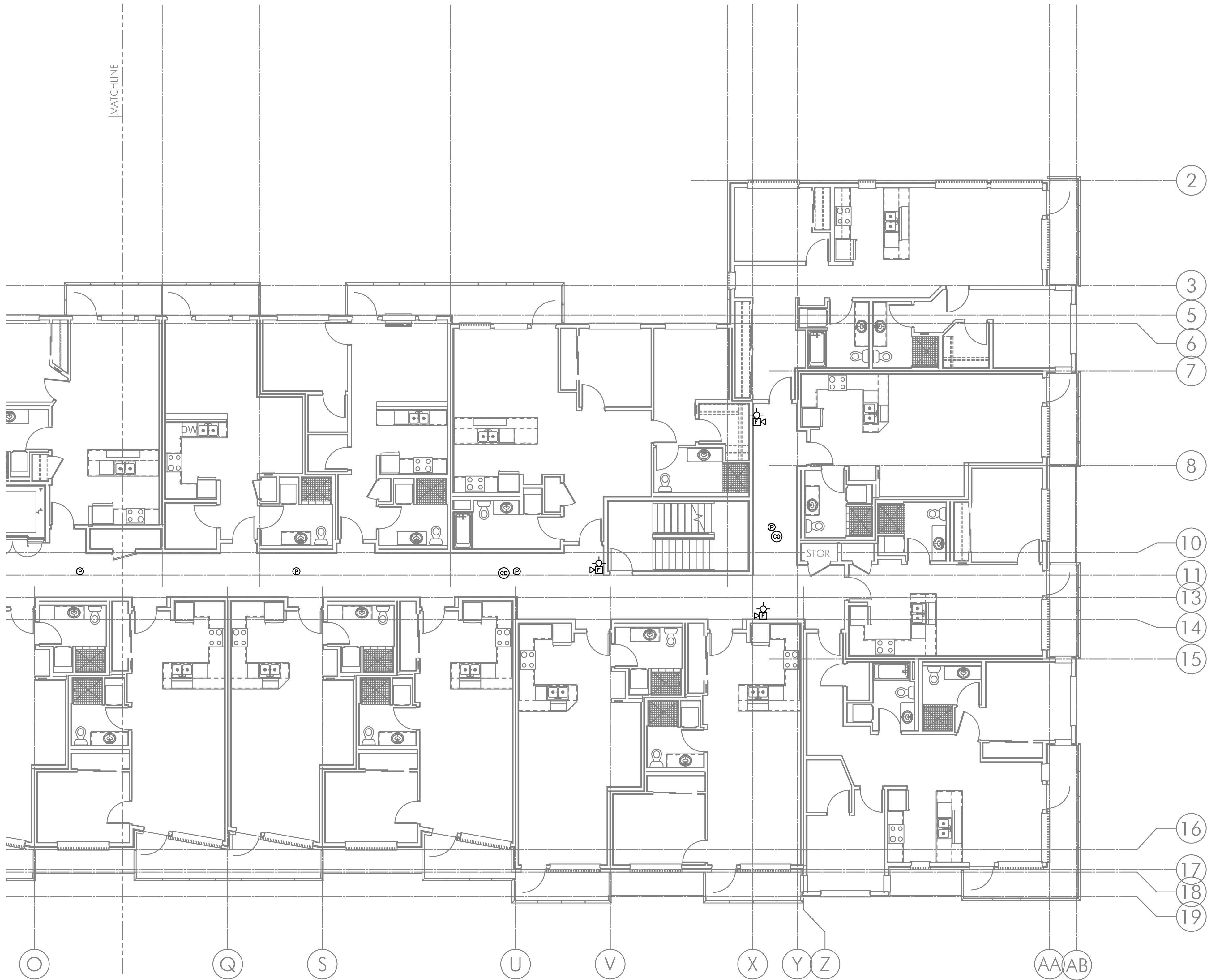
1 TELCOM PLAN – SECOND FLOOR EAST T3.02E SCALE: 1/8" = 1'-0"

FIRE ALARM AND DETECTION SYSTEM SHOWN ON PLAN(S) ARE FOR DESIGN INTENT ONLY. THIS IS A DEFERRED SUBMITTAL SYSTEM REQUIRING THE CONTRACTOR TO COMPLETE THE PERMIT READY DESIGN AND CALCULATIONS AS REQUIRED PER THE AUTHORITY HAVING JURISDICTION. VERIFY BUILDING OCCUPANCY TYPE AND OCCUPANT LOAD WITH ARCHITECTURAL PLANS.