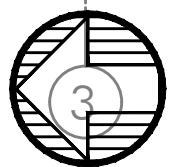
1 TECLOM PLAN - LEVEL 3 13.03 SCALE: 1/8" = 1'-0"