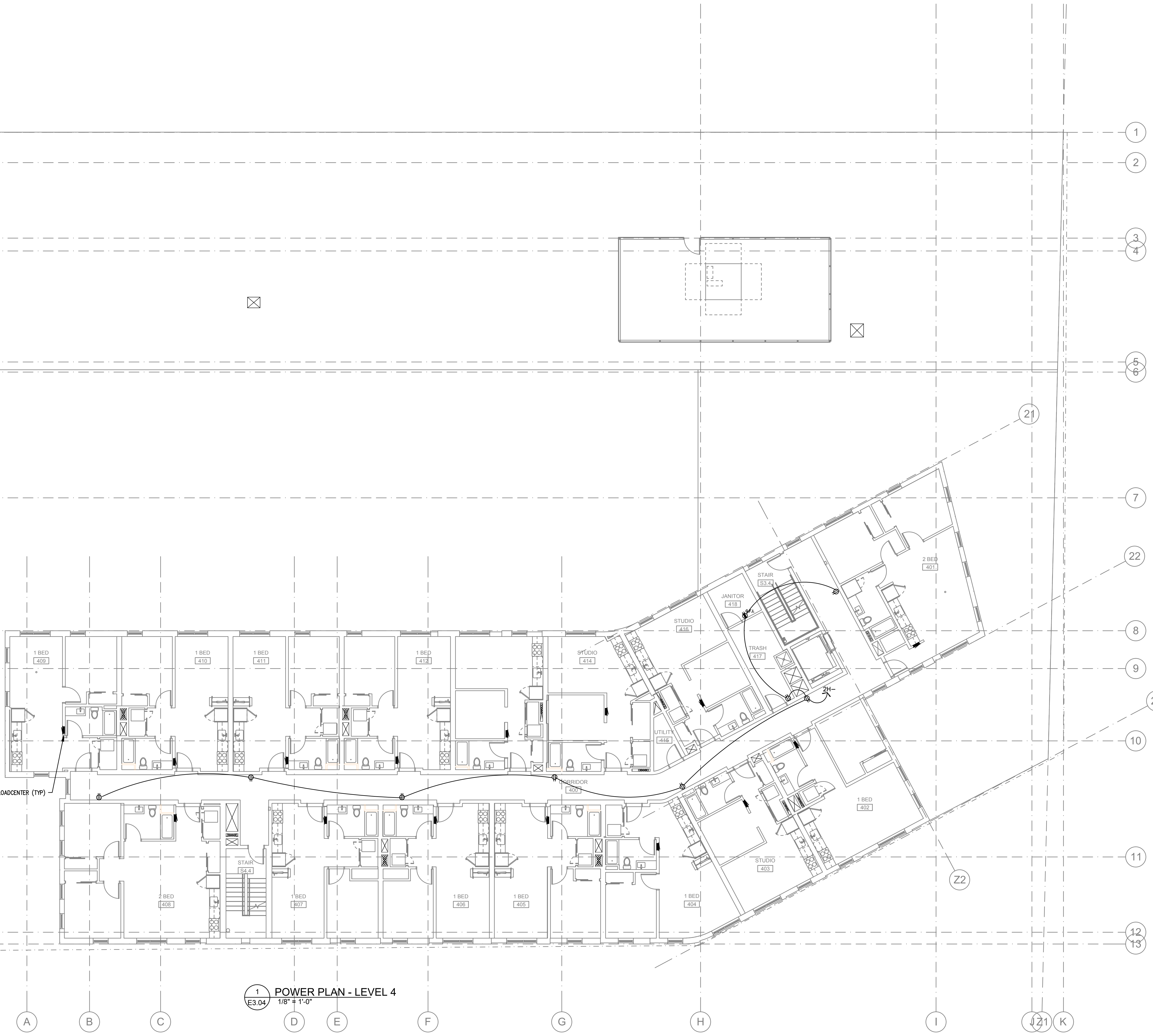
1 POWER PLAN - LEVEL 4 E3.04 1/8" = 1'-0"