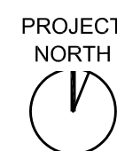
1 FIRST FLOOR REFRIGERANT PIPING PLAN SCALE: 1/8" = 1'-0"